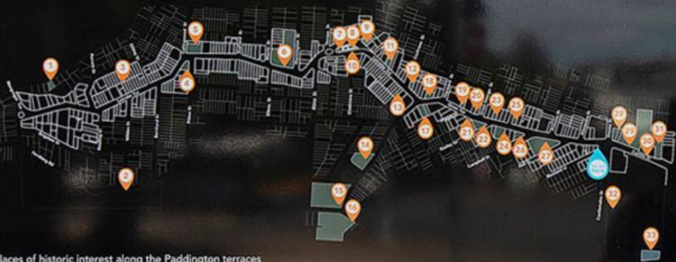
Places of historic interest along the Paddington terraces