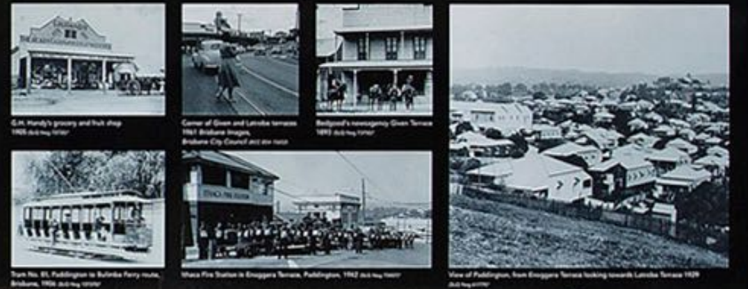
1. G.H. Hardy's grocery and Post shop, 1928. See my writer. 2. Corner of Green and Lancelotti terraces, West Brisbane Heritage, Brisbane City Council and the text. 3. Paddington's contemporary Green Terrace, 1912. See my writer. 4. View of Paddington, from Enggerra Terrace looking towards Lancelotti Terrace 1929. See my writer. 5. Bank No. 81, Paddington to Bulimba Ferry route, Brisbane, 1926. See my writer. 6. Mase's Fire Station in Enggerra Terrace, Paddington, 1922. See my writer. 7. View of Paddington, from Enggerra Terrace looking towards Lancelotti Terrace 1929. See my writer.

Funded by Queensland Government (Established in a better Brisbane)